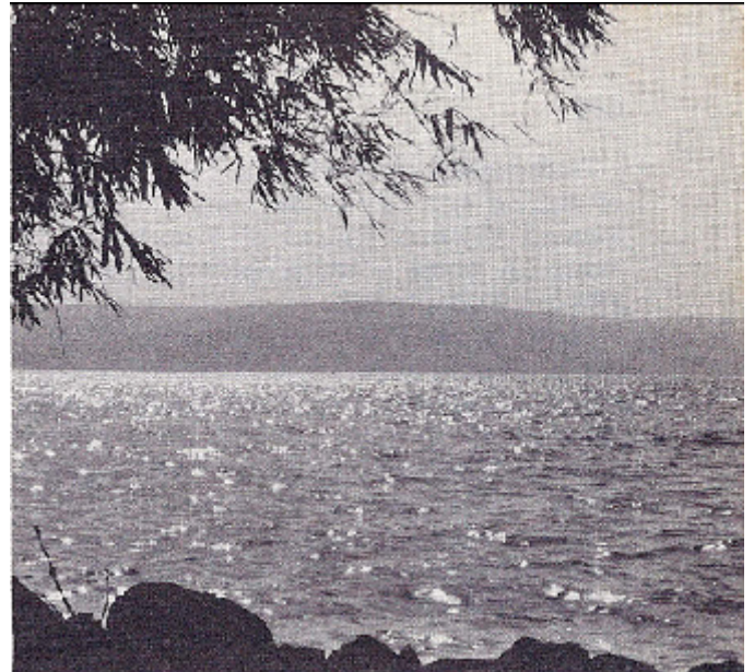
Sea of Galilee. This freshwater lake, fed by the Jordan River, is enclosed by hills except where the Jordan enters and leaves. Called a "sea" because of its considerable size, the lake is below sea level and has a semi-tropical climate. Violent storms can suddenly sweep down onto the lake from nearby Mount Hermon.

Gabbatha ("pavement"), an open space at the front of Herod's temple in Jerusalem, where Pontius Pilate sat to judge Jesus Christ (John 19:13).