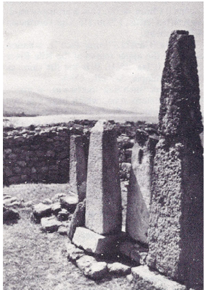
Ruins of Gebal . King Solomon hired stone masons from the Phoenician coastal city of Gebal (later called Byblos) to help build the temple in Jerusalem (1 Kings 5:18, RSV). Their skill is evidenced by these stone monuments at Gebal, 40 km. (25 mi.) north of Beirut . The craftsmen of Gebal also had a reputation for shipbuilding (Ezek. 27 :9).

Gethsemane ("oil press"), a garden east of Jerusalem, beyond the brook Kidron at the foot of Mount Olivet; the site of Christ's betrayal (Matt. 26:36-56).